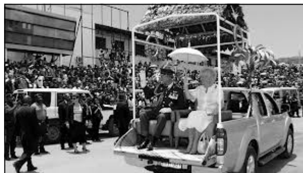
Prince Charles and Camilla, the Duchess of Cornwall tour the Sir John Guise stadium in Port Moresby in the back of a ute.

Prince Charles was invested with the insignia of a Grand Companion of the